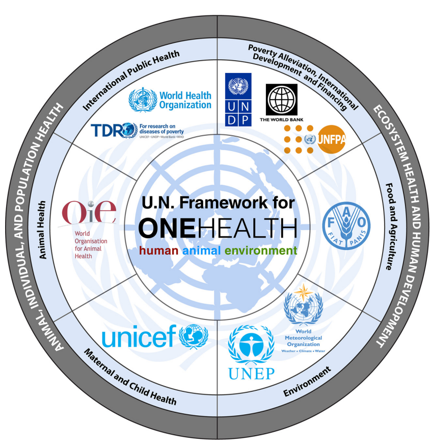
FIG 3 Proposed United Nations "One Health" framework. FAO, Food and Agriculture Organization; OIE, World Organization for Animal Health; TDR, WHO Special Programme for Research and Training in Tropical Diseases; UNDP, United Nations Development Programme; UNEP, United Nations Environment Programme; UNFPA, United Nations Population Fund; UNICEP, United Nations Children's Fund; WHO, World Health Organization; WMO, World Meteorological Organization.

canine-related zoonoses, and the importance of One Health and the globalized food supply chain (201, 272, 339–341).