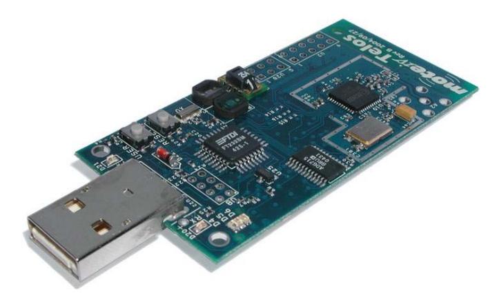
Fig. 1. Telos ultra-low power wireless module ("mote") with IEEE 802.15.4 wireless transceiver.

Mica [5], released in 2001, was carefully designed to serve as a general purpose platform for WSN research. Compared with preceding designs, it offered more memory (4kB of RAM and 128kB of flash), extensive sensor interfaces (8 analog lines, several digital IO