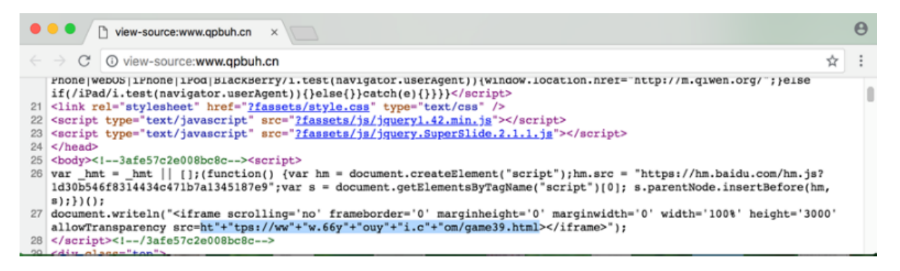
FIGURE 1. Source code fragment of http://www.qpbuh.cn.

browser, the content presented on the Web page is not the case. For instance, as soon as the source code is loaded, the browser will execute a JavaScript file with the path http://www.tuniubb.com/js1/tz.js, which contains a redirection operation to the URL: http://www.tuniubb.com/js1/ 11.php. Then the browser will load this PHP page, but 11.php is not the end. It further goes through 302 redirects to http://www.wuxin4.com/. In other words, what users eventually see in the browser is http://www.wuxin4.com/, which is a porn page. It is seen that the loading of http://www.bowas.cn/ experiences two different redirections. The first is executing the content of the JavaScript file, and the second is executing a 302 redirection. The redirection process is transparent to the users, who finally access a pornographic website, and thus the purpose of criminals is achieved.