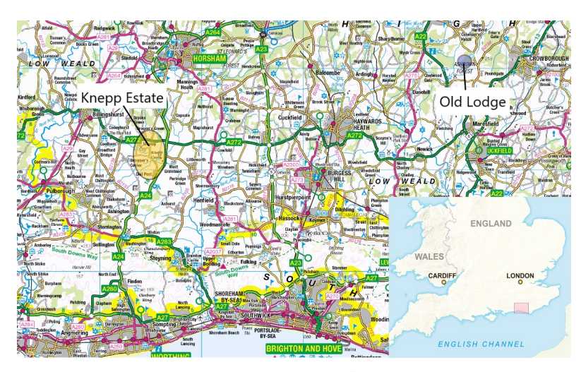
Map 1. The locations of Knepp Estate and Old Lodge (contains OS data © Crown copyright and database right 2021; reproduced with permission under Open Government Licence).

https://doi.org/10.1371/journal.pone.0241160.g001