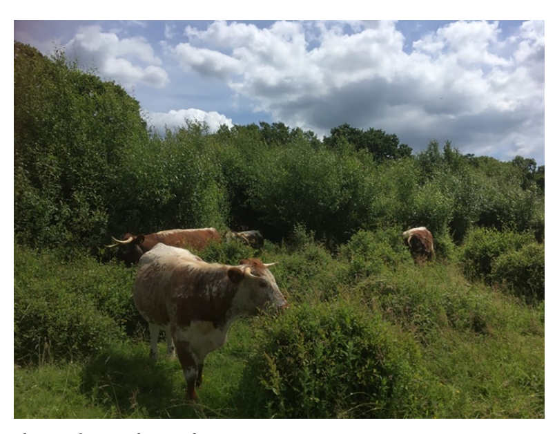
Photograph 1. Longhorn cattle at Knepp. https://doi.org/10.1371/journal.pone.0241160.g002

By 2006, Knepp had developed a proposed 'Holistic Management Plan for a naturalistic grazing project,' but it was not until 2009 that it managed to secure Higher Level Stewardship agri-environmental funding for the whole estate. This meant the Southern block could also be