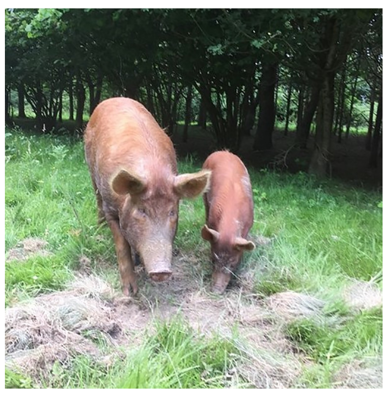
Photograph 2. Tamworth pigs at Knepp. https://doi.org/10.1371/journal.pone.0241160.g003

By 2006, Knepp had developed a proposed 'Holistic Management Plan for a naturalistic grazing project,' but it was not until 2009 that it managed to secure Higher Level Stewardship agri-environmental funding for the whole estate. This meant the Southern block could also be