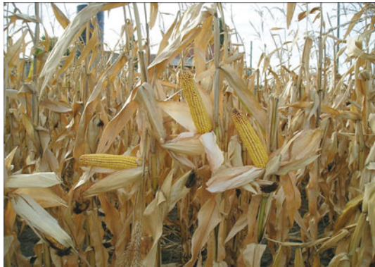
Figure 2. About one-half of dry matter produced by grain crops is in the form of inedible biomass. Owing to their low nitrogen content, crop residues are poorly suited for animal feeding, and well suited to be burned to obtain energy. Thus, crop residues have the potential to provide a strategic source of biofuels.