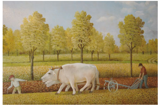
Figure 3. Plowing scene of the early 1930s. These pre-industrial agricultural systems rely solely on solar energy. Nevertheless, their low productivity per hectare, per hour of labor and per worker imply that: (i) more natural land has to be converted to arable crops to fulfil a production target; (ii) more people have to work in agriculture with a dramatically lower standard of living. (Painting by Franco Serafini, 1992).

As far as agriculture management is concerned, there are contrasting schools of thought on how to couple the solution