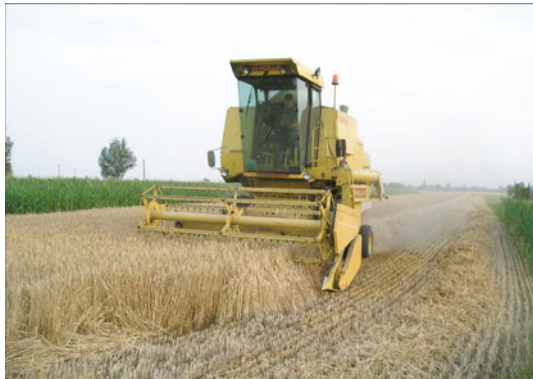
Figure 4. Industrialized agricultural systems are relatively highly dependent on fossil energy, but they allow more land area to be devoted to non-agricultural purposes and assure a better quality of life for both agricultural and non-agricultural workers.