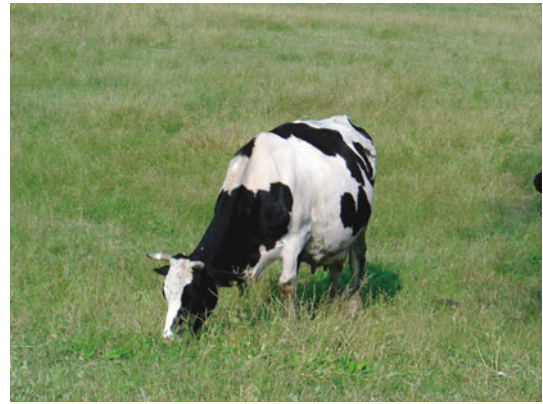
Figure 1. Prairie biomass is edible by domesticated herbivores, and thereby is converted into high-quality milk and meat foods. Grazing herds directly utilize the forage, displacing fossil fuel for hay harvesting and transportation.

Humans in their adult state are unable to synthesize 8 of the 20 different amino acids required for the synthesis of the body proteins, either at all, or at sufficient levels to fulfil growth and maintenance (Follett and Follett, 2001). These amino acids, referred to as essential amino acids, must be necessarily obtained from food sources and include: leucine, lysine, isoleucine, methionine, phenylalanine, threonine, tryptofan and valine. In addition, during infancy histidine is also required (Follett and Follett, 2001). Animal proteins contain adequate amounts of all essential amino acids and are easily digestible. In contrast, plant proteins are deficient in at least one essential amino acid, usually lysine for cereals, methionine and cysteine for legumes, and are also less easy to digest (Smil, 2002). Yet, an additional aspect should be considered: ruminants combine the ability to digest cellulose-rich plant biomass with the ability to convert low-quality plant proteins into high-quality animal