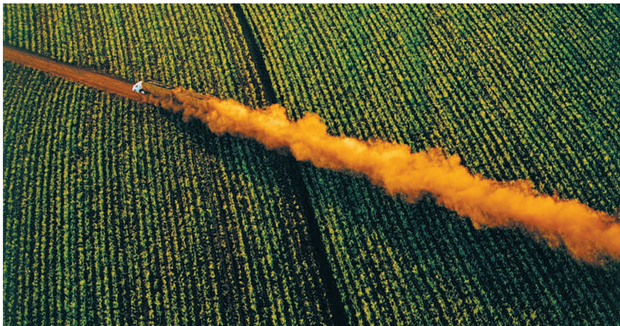
A truck full of sugar cane crosses farmland in Brazil, a leader in bio-based ethanol production from the crop.