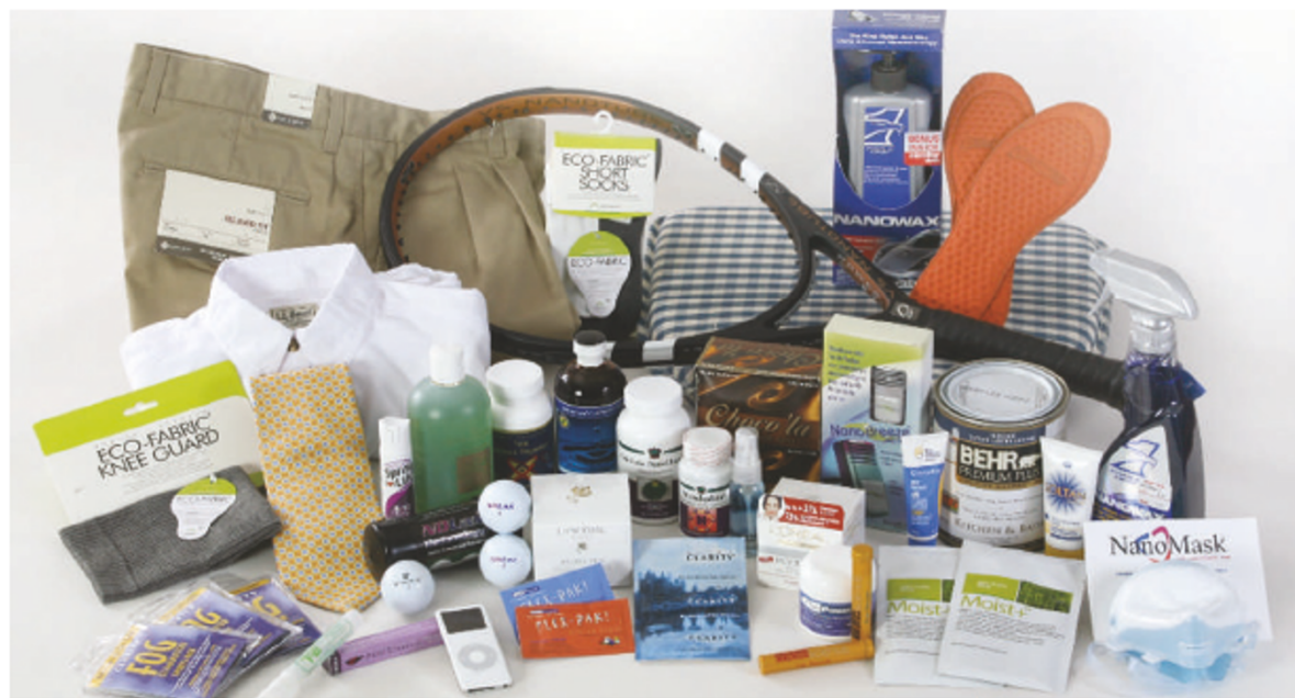
Nanotechnology is rapidly advancing, with more than 300 nanoproducts already on the market.

"Without strategic risk research, public confidence in nanotechnologies could be reduced through real or perceived dangers."