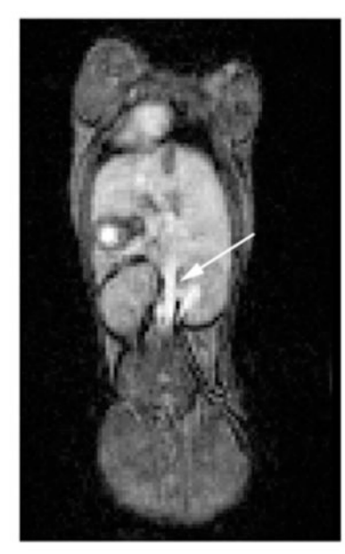
Figure 2. Coronal slice from a whole-body MRI of a mouse before (left) and 30 min after (right) administration of Hydrochalarone-6. The unidentified bright spot in both the pre- and postcontrast images is likely an artifact.