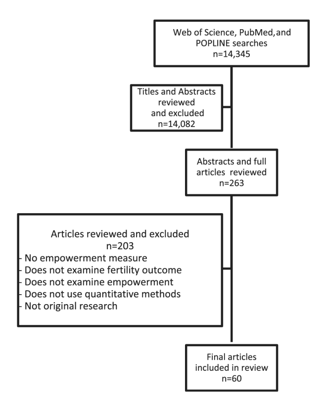
Fig. 1. Flow chart of literature search.