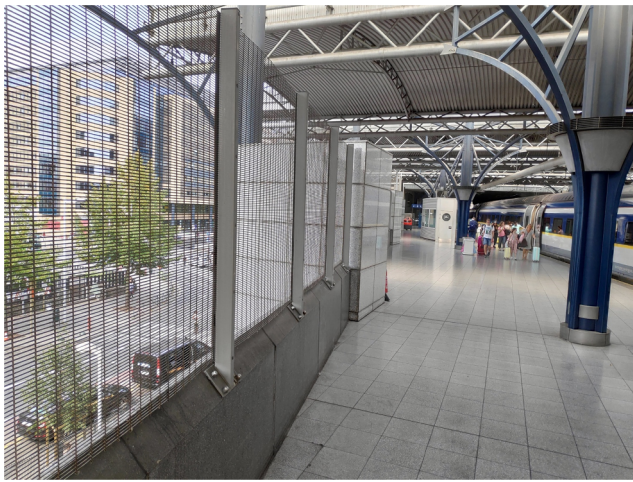
Fig. 1. The informal black vans ( navettes ) can be seen (bottom-left) directly from the Eurostar platform of the Bruxelles-Midi station (right), in a striking juxtaposition of transport modes that operate at radically different levels of (in)formality, (in)visibility and regulatory endorsement.

Albeit located in the very heart of Belgium's highly formalised, regulated and elaborate transport system, the navettes operate on its fringes. Relying on qualitative fieldwork, in this article we offer the first academic account of the navettes . We attempt to understand how they operate, and how they struggle for legitimacy in the unlikely and unfriendly context of the transport landscape of Brussels. We approach the navettes as one of many urban mobility practices of the global North that largely depend on informal practices as a basis for their operation, while remaining partially regulated or formalised (Best, 2016; Goldwyn, 2018). However, responding to the lack of engagement with informality in transport literature that examines cities in the global North, as well as to the recent calls for decolonising knowledge about transport (Schwanen, 2018; Wood et al., 2020), we scrutinise the navettes through the lens provided by the literature on informality in the global South and East.