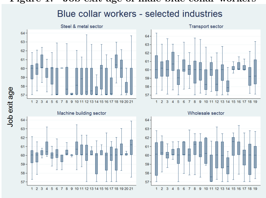
Figure 1: Job exit age of male blue-collar workers ^a