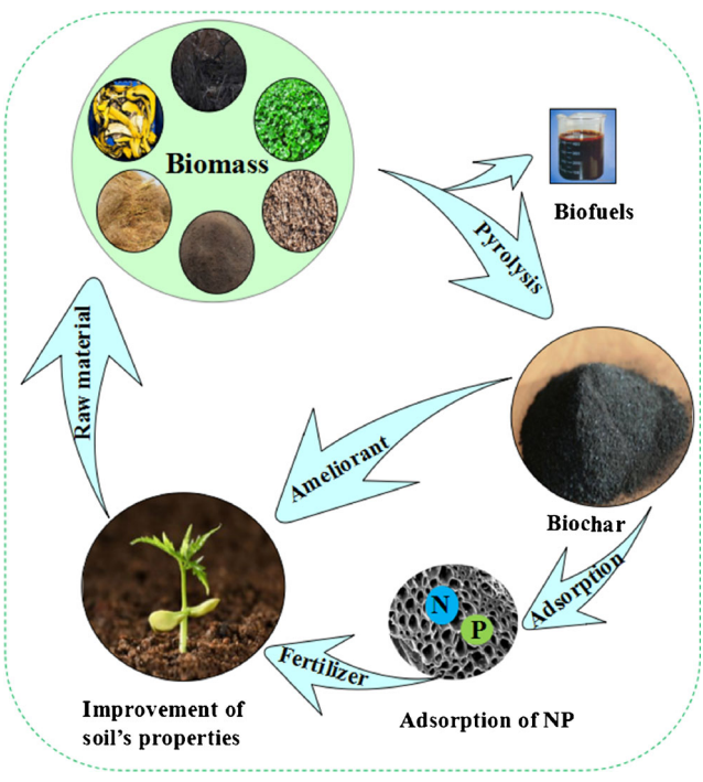
Fig. 1 The benefits of biochar applied as a tool for soil fertility management

Biochar is the by-product of biomass pyrolysis in an oxygen depleted atmosphere. It contains porous carbonaceous structure and an array of functional groups (Lehmann and Joseph 2009).