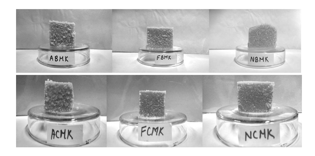
Fig. 1 Chopped diced sample of khoa ABMK- acidic buffalo milk khoa , FBMK- fresh buffalo milk khoa , NBMKneutralized buffalo milk khoa ACMKacidic cow milk khoa , FCMK- fresh cow milk khoa , NCMKneutralized cow milk khoa

values were higher in cow milk khoa as compared to buffalo milk khoa which might be due to higher protein and ash content as compared to buffalo milk khoa. Wasnik et al. (2015) reported positive correlation between chewiness and protein content of santraburfi. Acidic samples had significantly higher (p < 0.05) values for chewiness as compared to khoa samples from fresh and neutralized milk which might be due to higher total solids and granular texture of acidic khoa samples as compared to fresh and neutralized samples (Choudhary et al. 2016). Since chewiness is a secondary parameter derived from hardness, cohesiveness and springiness, hence a slight change in these textural parameters also affected it. Gupta et al. (1990) also reported that the increase in total solids resulted in increase of instron chewiness in khoa. Adhikari et al. (1994) also reported negative correlation between moisture and instron chewiness of khoa. Rajorhia et al. (1990) observed similar findings and reported that chewiness was highest in acidic buffalo milk khoa followed by khoa samples prepared from fresh and neutralized buffalo milk. Puranik et al. (1998) reported chewiness values up to 1.60 in cow milk khoa.