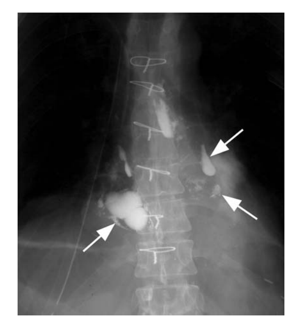
Fig. 1 Chylothorax after esophagectomy in the case of esophageal carcinoma. Leakage of the thoracic duct at the level Th6/Th7. Note the extravasated lipiodol (arrows)